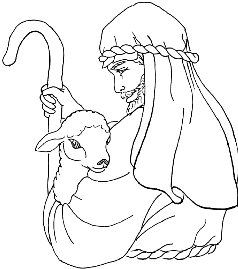
The Good Shepherd